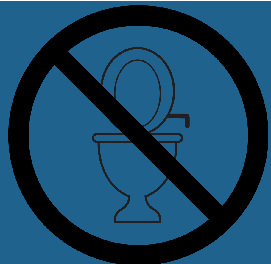
No use of public washrooms