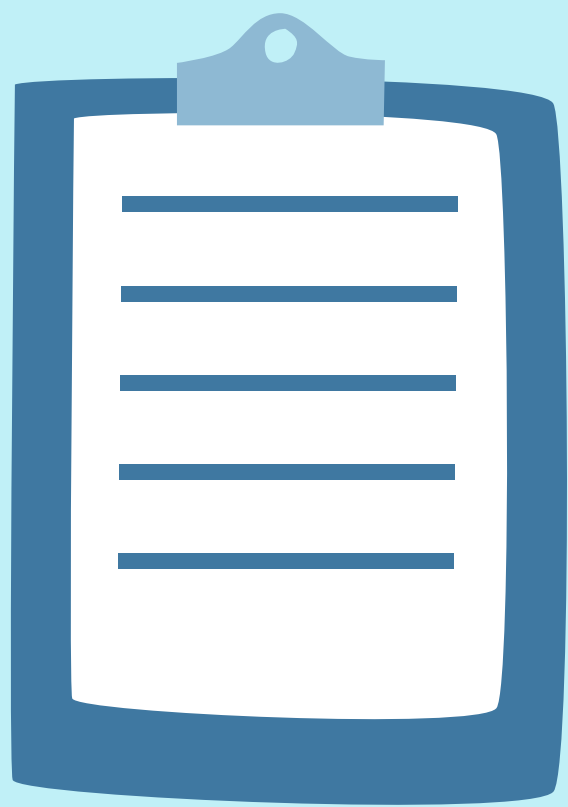
Symptom screening prior to appointments

We have put additional safety measures in place to protect the health and safety of staff and clients. Your cooperation is appreciated . Here is what you can expect.