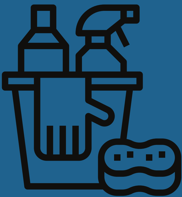
Disinfecting between appointments