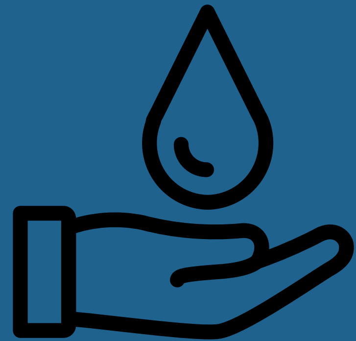
Hand Sanitization upon arrival